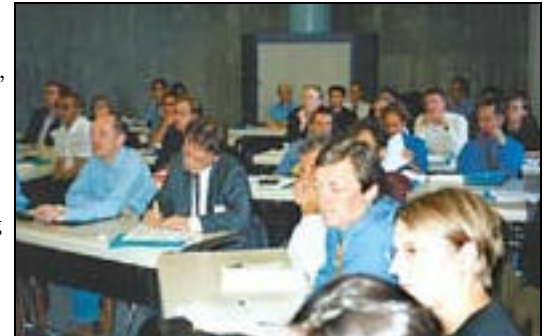
Session Meeting In Lausanne

There were over 120 ITS delegates in attendance. Representation came largely from Europe, but also from Canada and the United States, and as far away as Argentina, Japan, Korea, India and Malaysia.