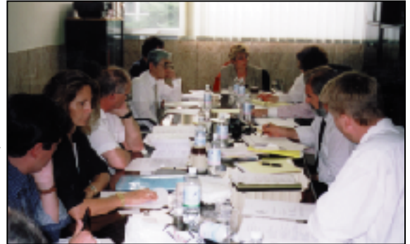
ITS Board Meeting In Turin

The picturesque city provided a splendid setting, allowing participants to benefit from the warm Northern Italian hospitality and cuisine. The event was hosted by Politecnico di Turino, an institution that has